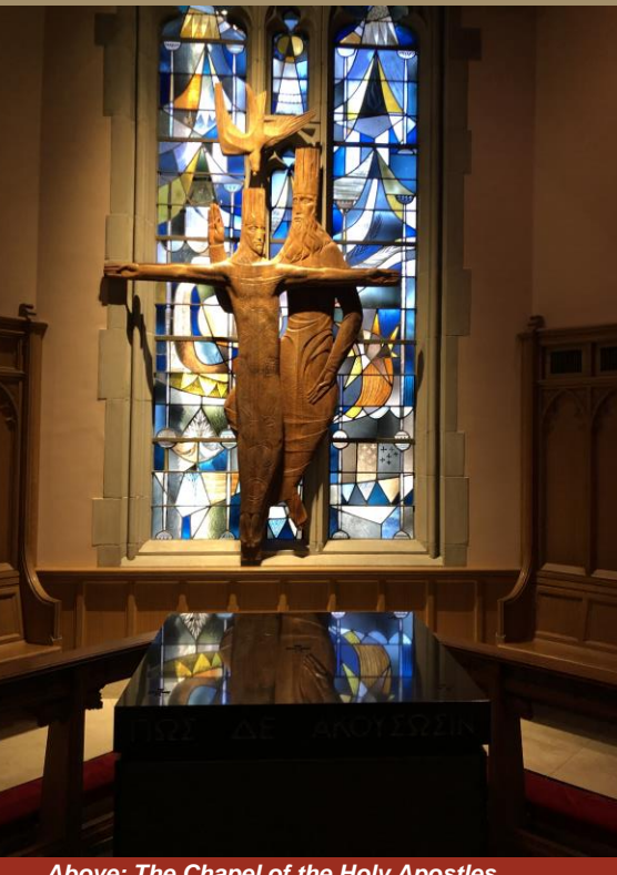
Above: The Chapel of the Holy Apostles, Concordia Seminary