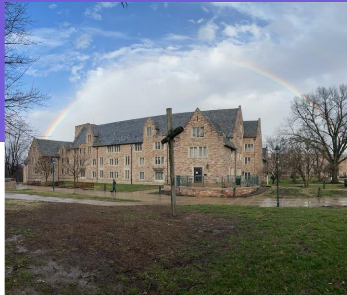
Above: Rainy day rainbow over campus, looking east from Chapel Plaza