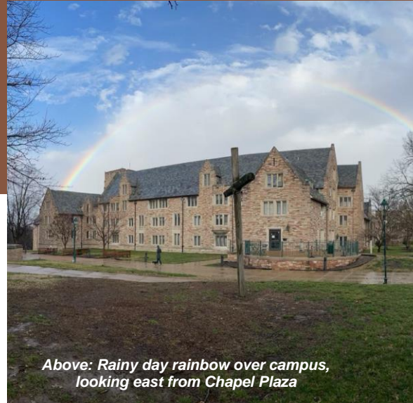
Above: Rainy day rainbow over campus, looking east from Chapel Plaza