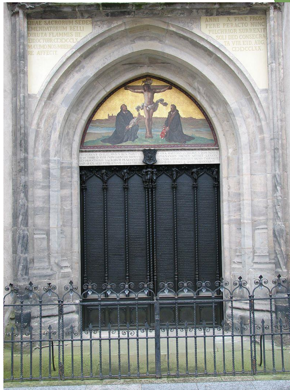
Commemorative Doors of Wittenberg's All Saints' Church, installed 1858