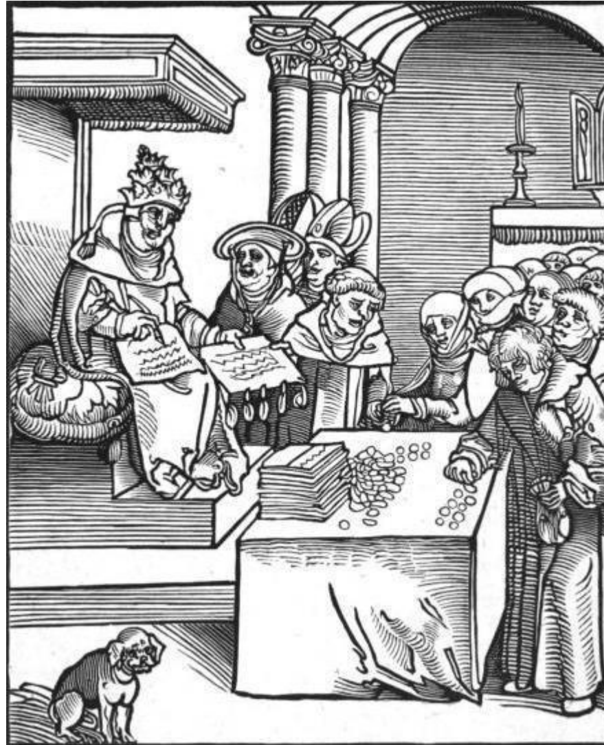
Pope as the Antichrist, signing indulgences, from Luther’s 1521 Passional Christi un Antichristi By Lucas Cranach the Elder

Thesis 82. To wit:— “Why doesn’t the pope empty purgatory, for the sake of holy love and of the dire need of the souls that are there , if he redeems an infinite number of souls for the sake of miserable money with which to build a Church? The former reasons would be most just; the latter is most trivial.”