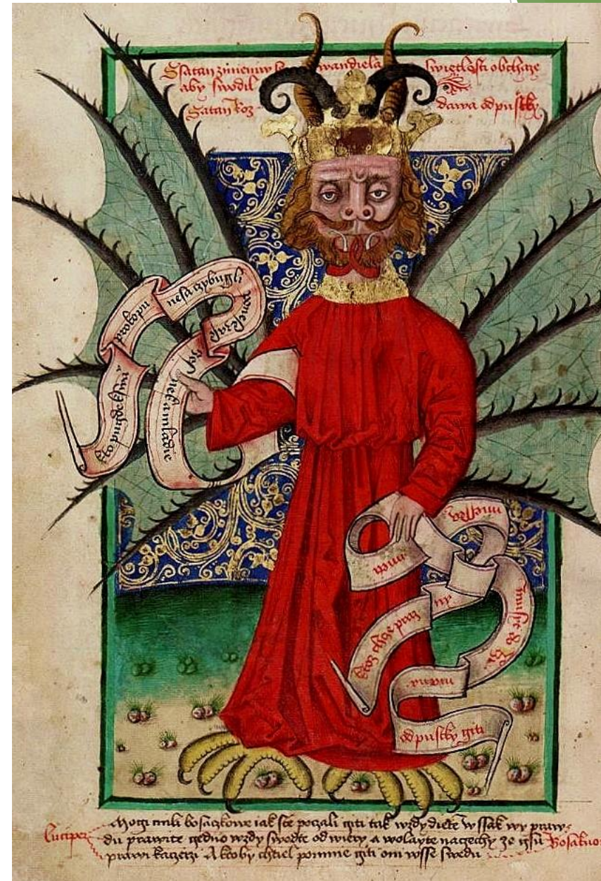
Satan Distributing Indulgences, Czech Manuscript, c. 1490