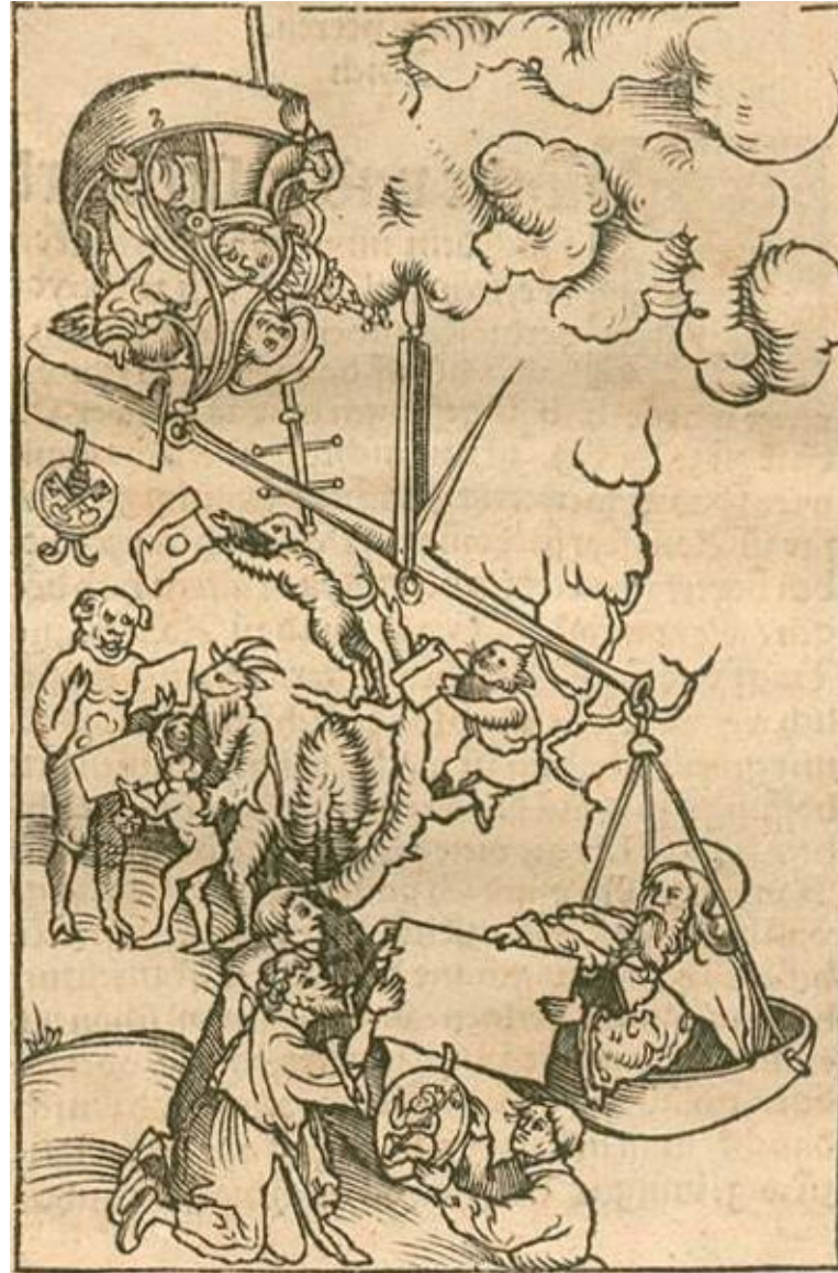
1525 Woodcut of forgiveness from Christ outweighing the pope's indulgences.