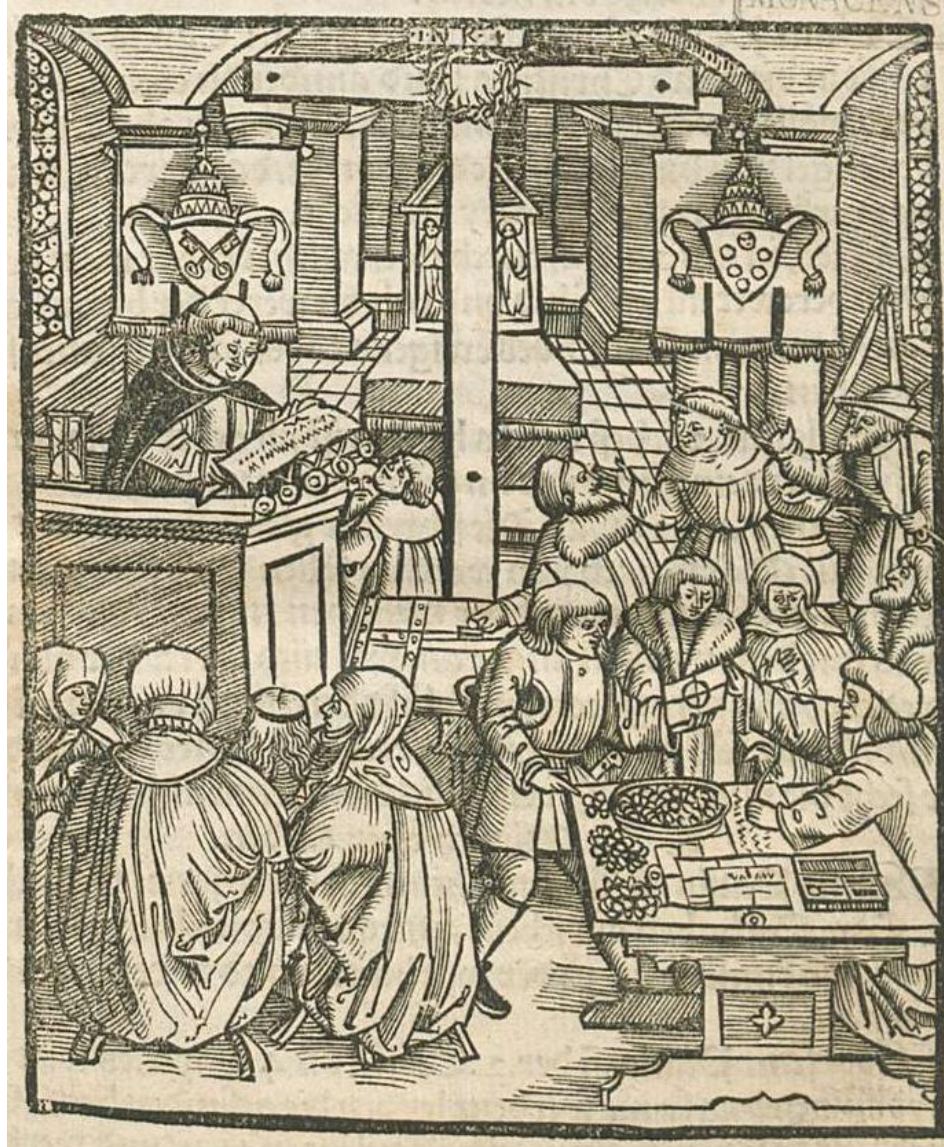
Woodcut of an indulgence seller, 1521